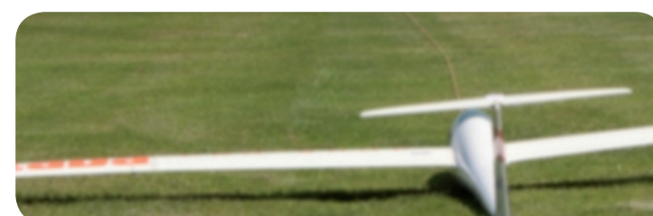
Scale Glider Tows