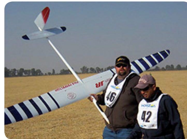
FAI F3J Gliding