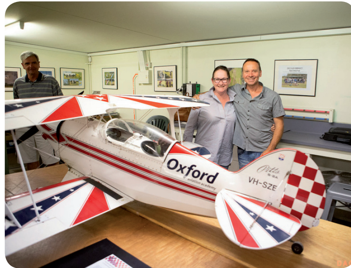
FAI F4C Scale

From the 1970s through mid 1980s. Most model aircraft clubs in Melbourne held annual RC airshows. Proceeds from gate takings were often split between a local charity and funding improvements at the field. This does not happen now. Short five minute demonstrations of a multitude of disciplines, all in one day, ties in with VMAA's sporting club emphasis.