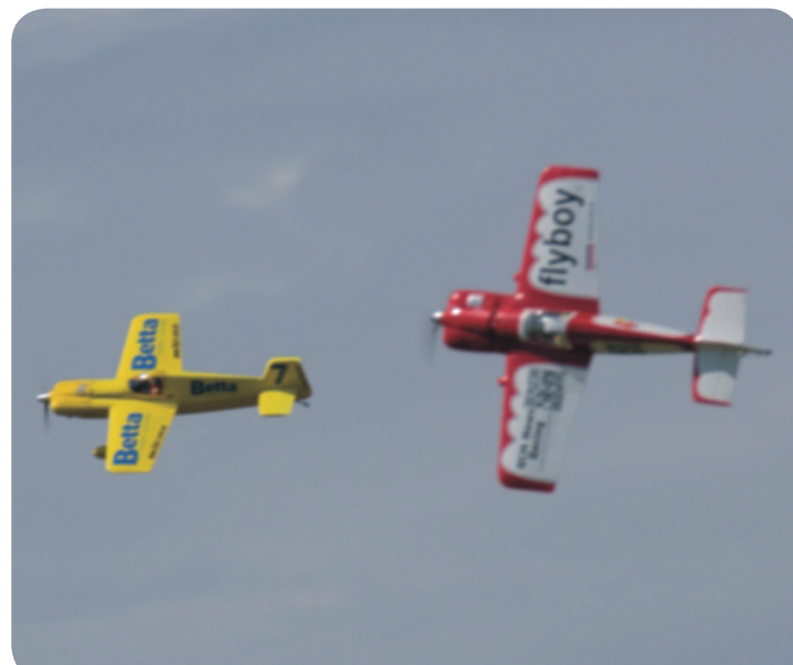
Scale Air Race