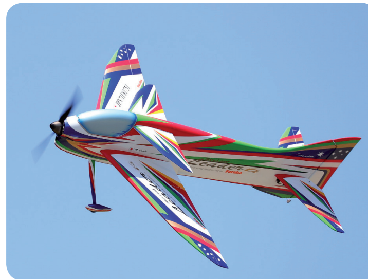
FAI F3A Aerobatics