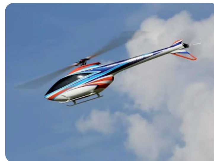
FAI F3C Helicopter