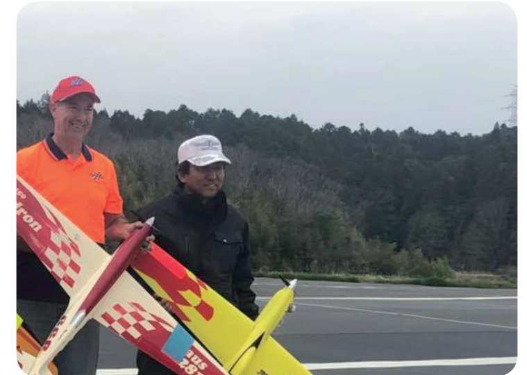
FAI F3D Racing